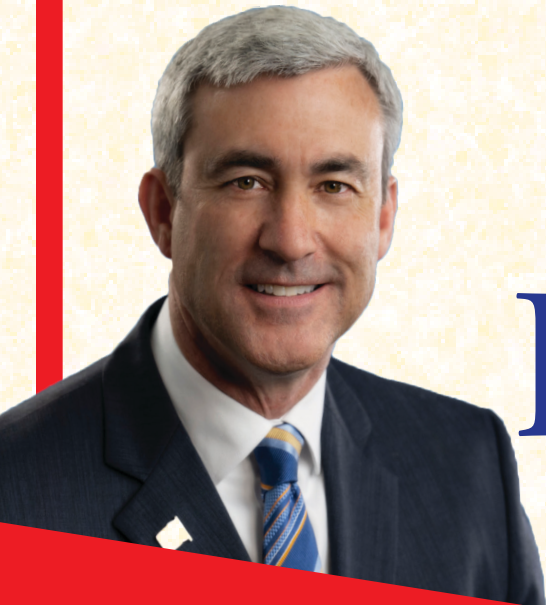
State Senator ROB HUTTON